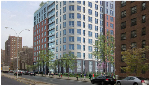
Lottery opens for 25 affordable units in Brownsville