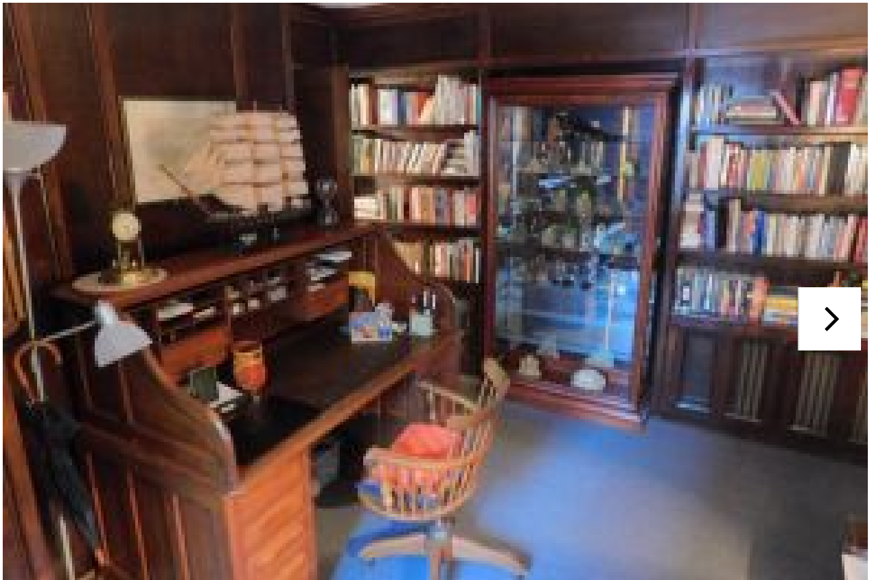
Take a tour of Trump's childhood home in Queens