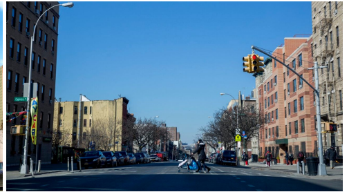
Report: Real estate investment surging in the Bronx