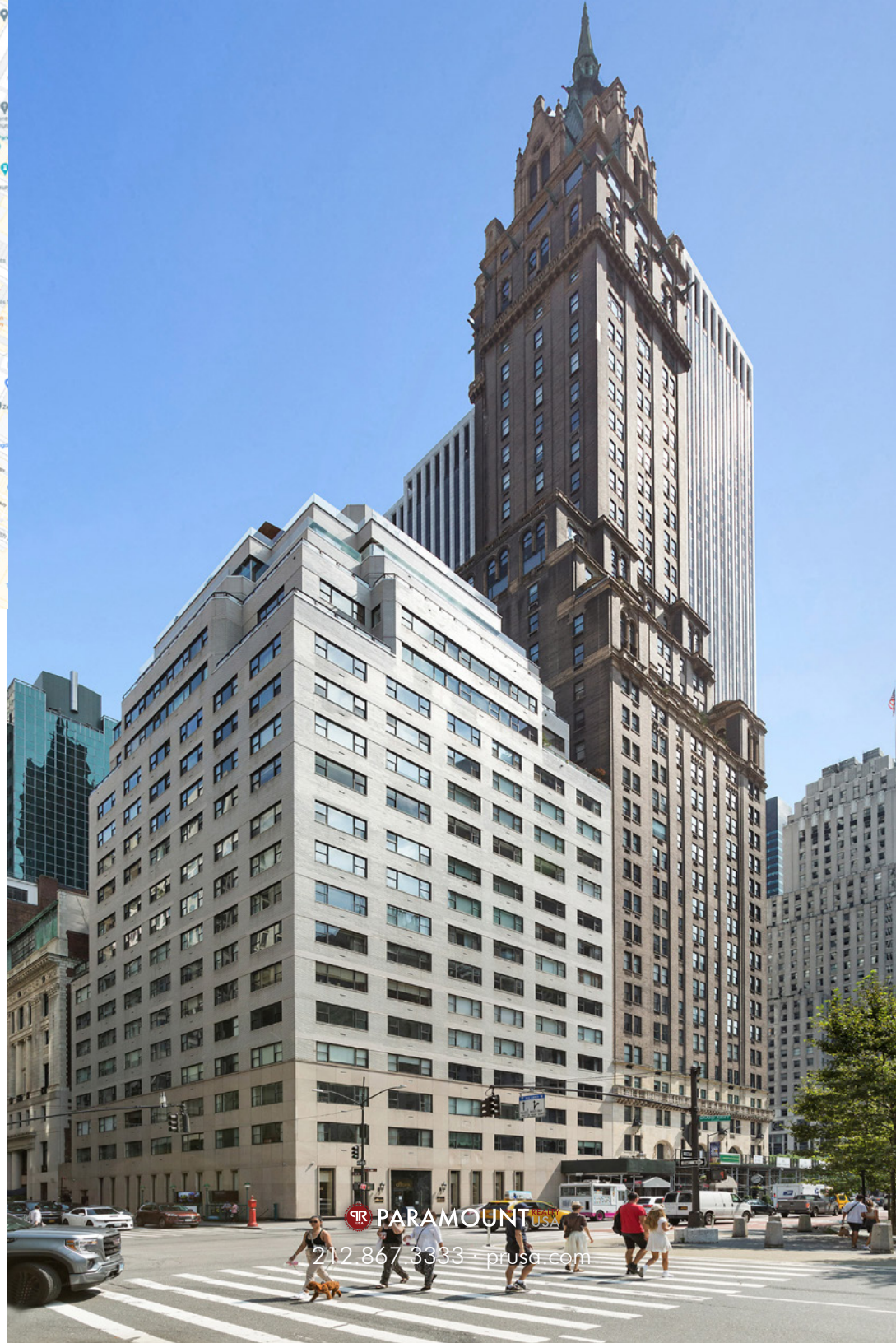
60TH STREET WITH DIRECT VIEWS OF CENTRAL PARK