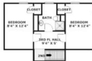
3RD FLOOR 358'4" SQ. FT.

This floor plan illustration is an approximation of existing structures and features and is provided for information only. It is not intended to be used for construction purposes. All measurements are approximations and not guaranteed to be exact in any way. Buyer should conduct measurements using their own tools.