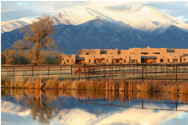
A New Mexico ranch is slated to go on the auction block in December.

Known as Blackstone Ranch, the New Mexico property is heading to auction with a reserve price of $19 million—a 65% reduction from its original asking price.