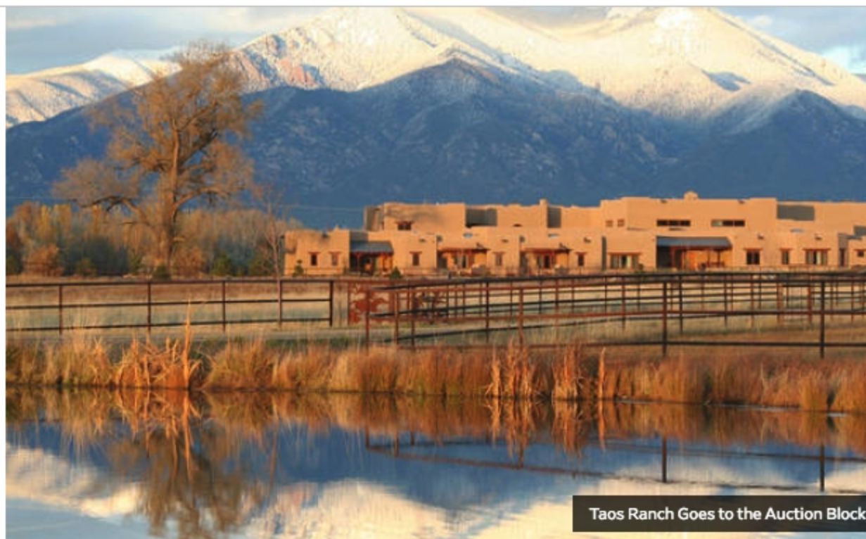
Taos Ranch Goes to the Auction Block